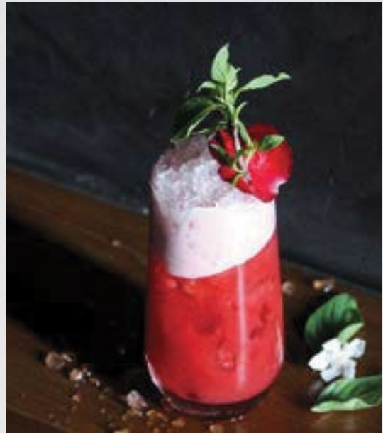
HYPNOTIC RASPBERRY 220

Cranberry Juice, Vanilla Syrup, Lime Juice, Egg White, Basil Leaves, Raspberry Purée, Perrier Mineral Water