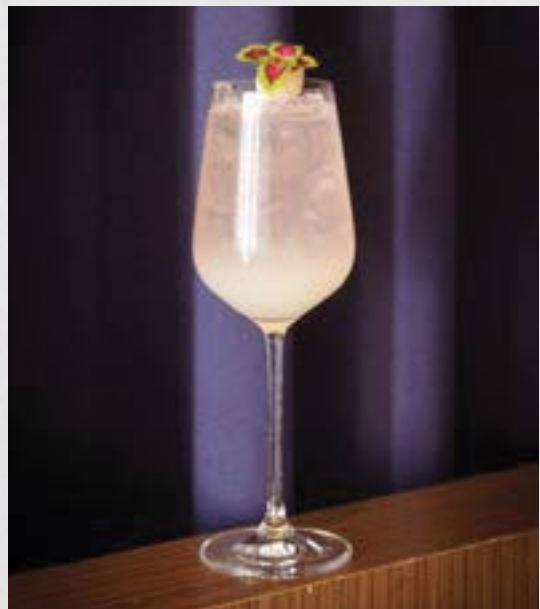
DELICATE LYCHEE SENSATION 220

Yuzu Puree, Bubble Gum Syrup, Lemon Juice, Pineapple Juice, Mango, Coriander