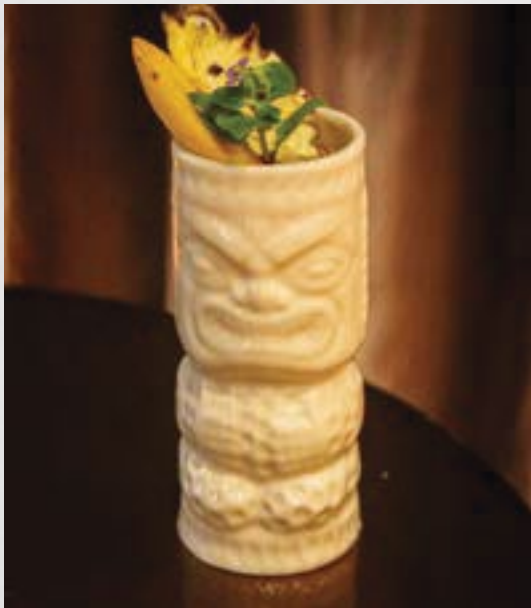
CANDY SHOP 200

Cranberry Juice, Vanilla Syrup, Lime Juice, Egg White, Basil Leaves, Raspberry Purée, Perrier Mineral Water